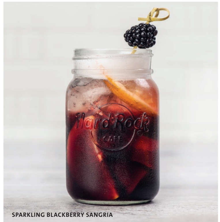
SPARKLING BLACKBERRY SANGRIA

Orange Juice • Grapefruit Juice • Cranberry Juice Apple Juice • Pineapple Juice