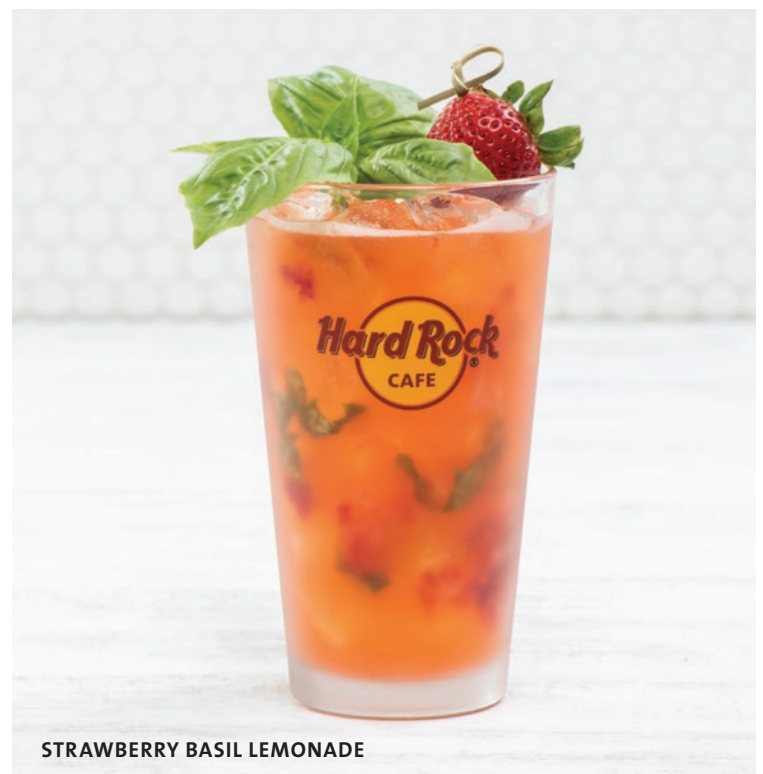
STRAWBERRY BASIL LEMONADE