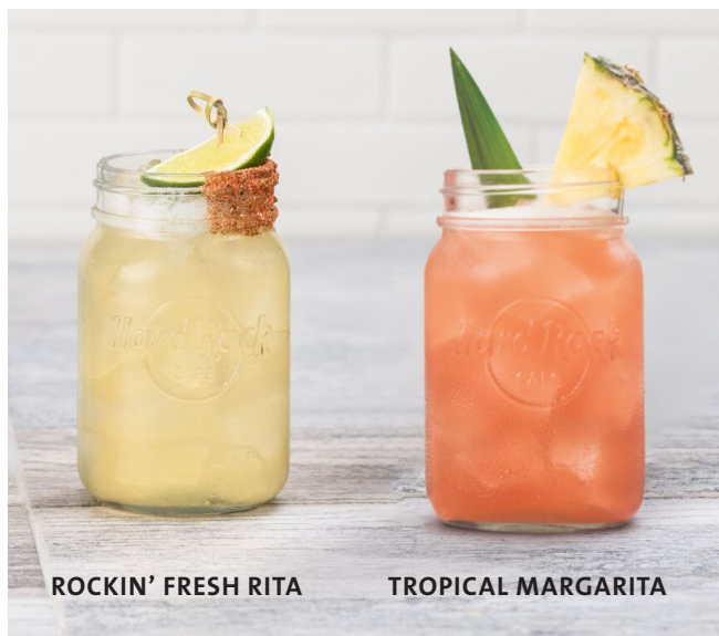
ROCKIN' FRESH RITA

A NYC classic originating in the 1800s. Woodford Reserve Bourbon, Antica Sweet Vermouth, cherry bitters and finished with a Filthy® cherry. $16.00 (192 cal)