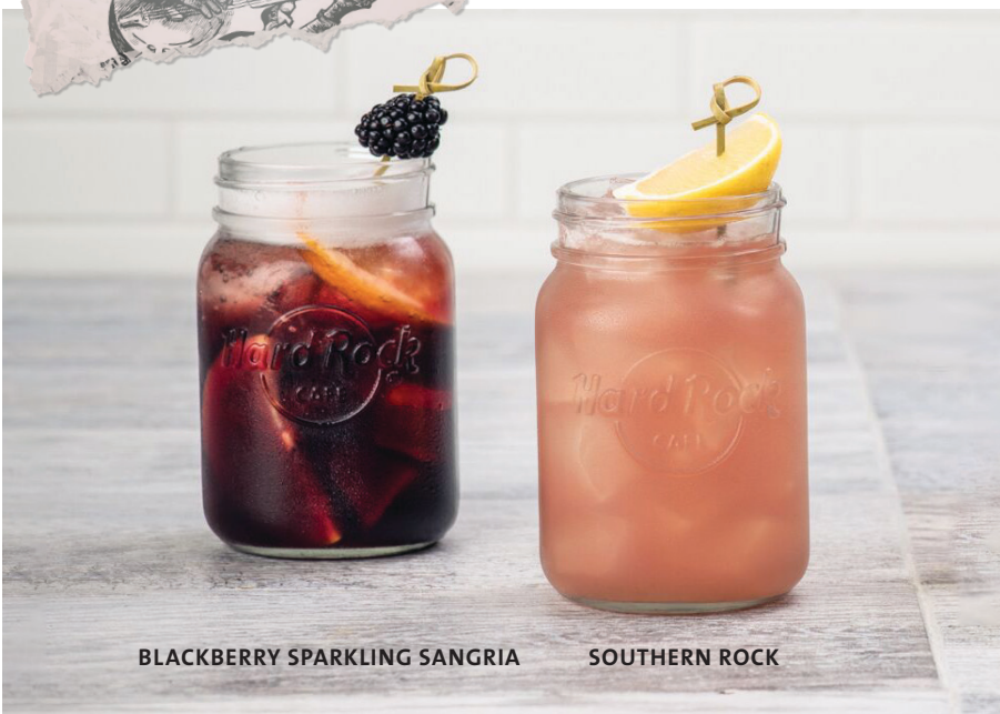
BLACKBERRY SPARKLING SANGRIA