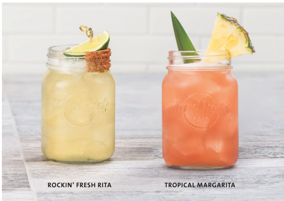
ROCKIN' FRESH RITA

Smirnoff Vodka, Bacardi Superior Rum, Beefeater Gin and DeKuyper Blue Curaçao with sweet & sour and topped with Red Bull® Yellow Edition. $13.99 (243 cal)