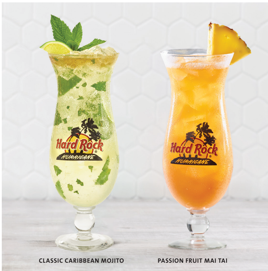
CLASSIC CARIBBEAN MOJITO