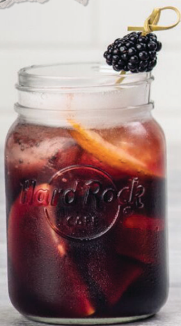
BLACKBERRY SPARKLING SANGRIA