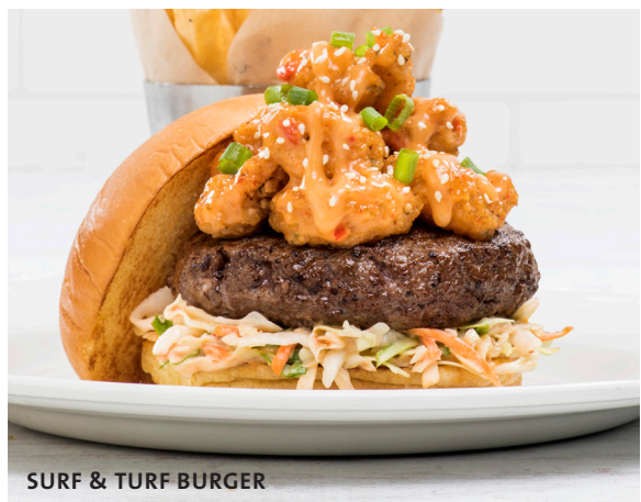
SURF & TURF BURGER