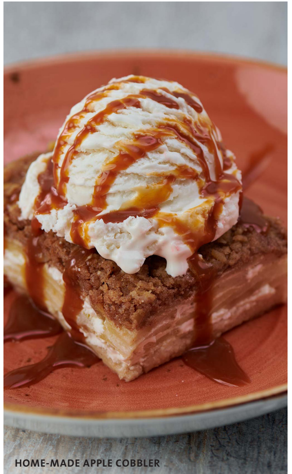
HOME-MADE APPLE COBBLER

Your choice of Madagascar vanilla bean or rich chocolate ice cream blended thick and finished with fresh whipped cream. $6.99 (557 cal)