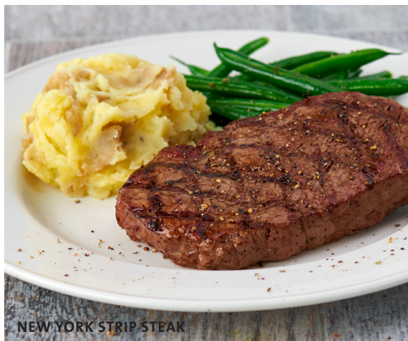
NEW YORK STRIP STEAK

Enjoy Surf n'Turf style with One Night in Bangkok Spicy Shrimp™, add $6.00 (480 cal)