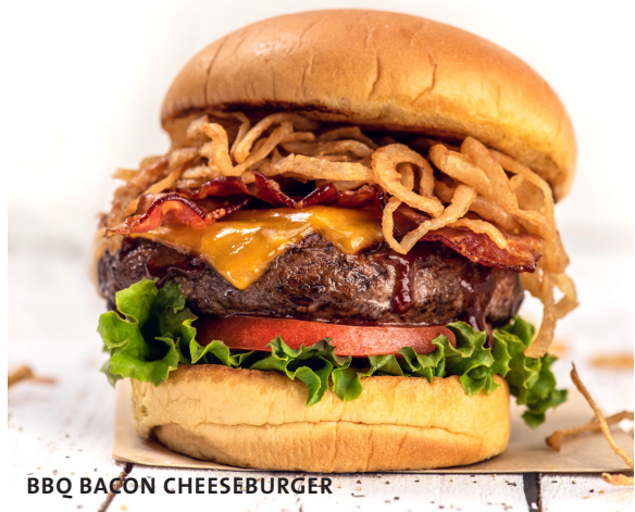
BBQ BACON CHEESEBURGER

Upgrade Cheese Fries with Applewood Bacon $4.50 (960 cal)