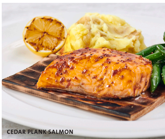
CEDAR PLANK SALMON

Crispy, fresh chicken tenders served with seasoned fries, honey mustard and our house-made barbecue sauce. $21.99 (1520 cal)