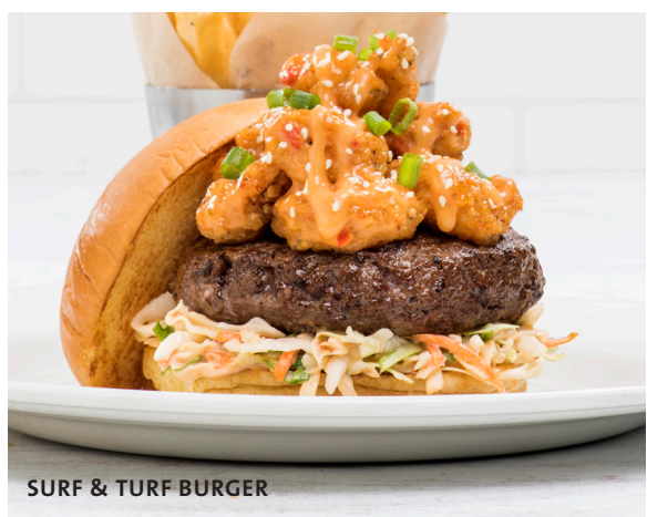
SURF & TURF BURGER